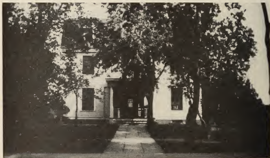
THE EPISCOPAL RESIDENCE